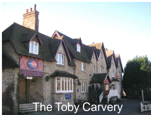
The Toby Carvery